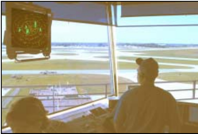
STARS system at Air Traffic Control Tower at the Des Moines International Airport.

the operation. The system can also help with security. For instance, it can map out the limits of restricted air space such as the recent presidential visits on Air Force One. Bhatia said Des Moines was one of the first 20 airports selected because of its mix of aircraft—passenger planes, private planes, cargo and military jets. Also, the sharp increase in air traffic here warrants attention.