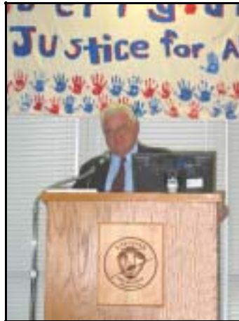
Congressman Leonard Boswell

The original dedication took place on November 9 th , 2002, but the monument