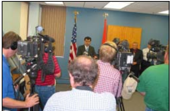
Karan Bhatia, Asst. Secretary for Aviation and International Affairs for the U.S. Department of Transportation at Press Conference in Des Moines

The Des Moines International Airport is one of a select group of airports across the country chosen to implement the new Standard Terminal Automation Replacement System (STARS). Karan Bhatia, Asst. Secretary for Aviation and International Affairs for the U.S. Department of Transportation, came to Des Moines for the unveiling of the new system at a press conference on June 22. Bhatia said, "With this sophisticated software, technology has given air traffic controllers information on aircraft and weather at the touch of a keyboard!" Another feature of the system is its backup capability that keeps operating even if there's a malfunction in one part of